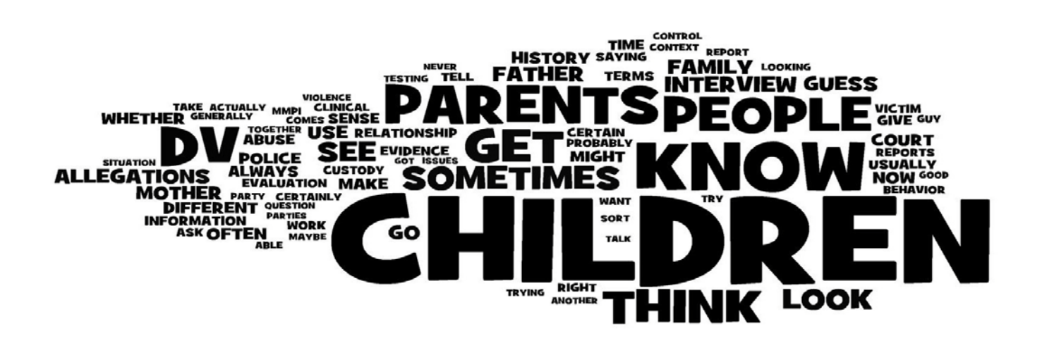
Figure 5.1. Graphic representation of word frequencies regarding how evaluators assess DV allegations